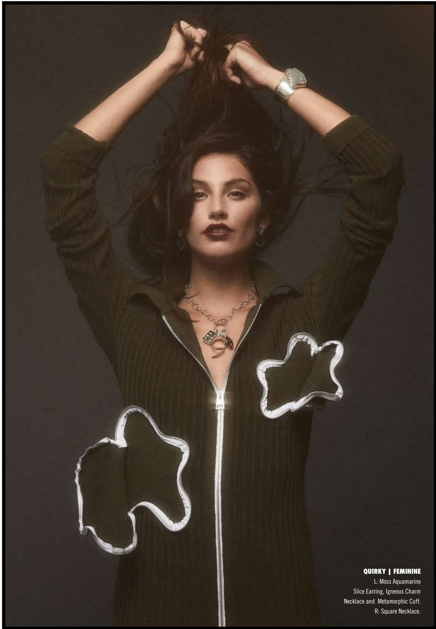
QUIRKY | FEMININE L: Moss Aquamarine Slice Earring, Igneous Charm Necklace and Metamorphic Cuff. R: Square Necklace.