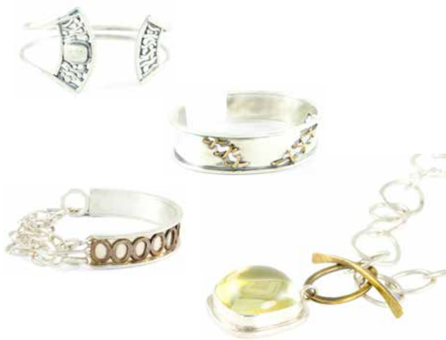
FANCY WEDGE CUFF | STITCHED BANGLE CUFF | OVAL MIXED CHAIN TOGGLE BRACELET | LEMON DROP NECKLACE