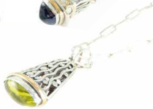
WINDCHIMES EARRING | IOLITE TOWER NECKLACE | LEMON QUARTZ FANCY DROP NECKLACE