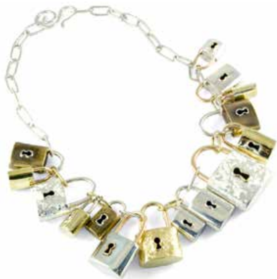
PADLOCK THREADER EARRING | SUGARLOAF HESSONITE GARNET RING | PONT DES ARTS NECKLACE