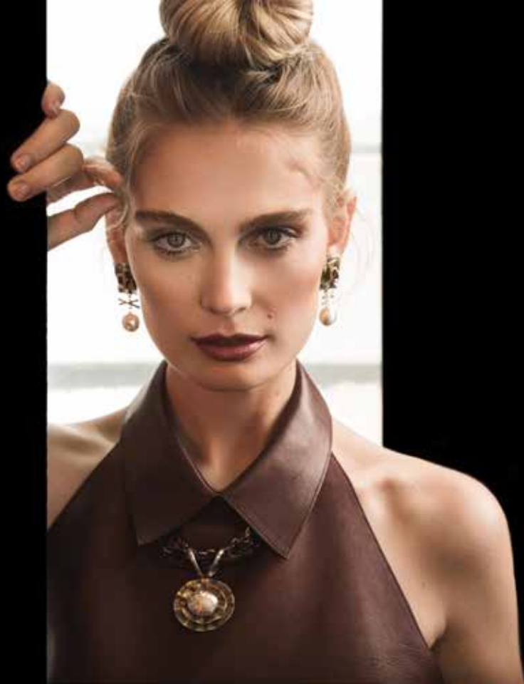
GARNET RUFFLE NECKLACE | GARNET RUFFLE BALL EARRING | LUNAR TOGGLE BRACELET