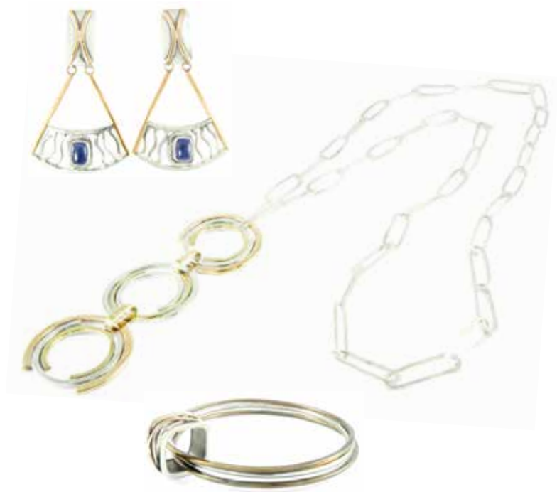
IOLITE FANCY WEDGE EARRING | LUNAR NECKLACE | AXIS MIXED BANGLES