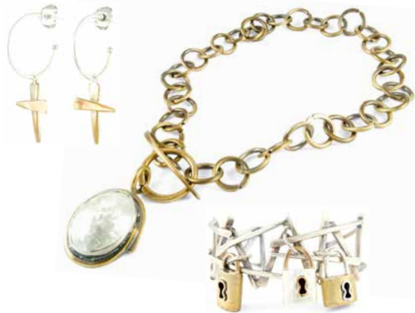
CROSS HOOP EARRING | TEXTURED FAT CHAIN NECKLACE | PONT DES ARTS CUFF