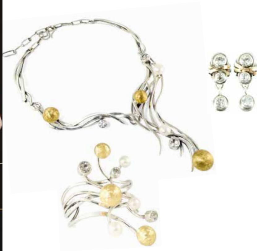
ELECTRON NECKLACE | PETITE DROP EARRING | ELECTRON CUFF