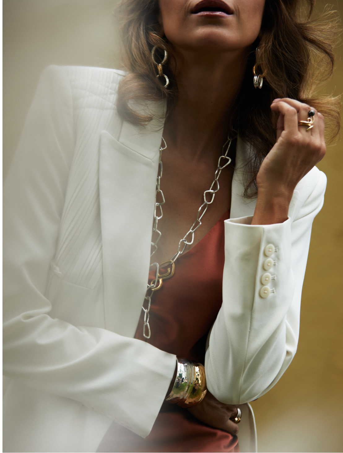
LEFT | TRIPLE LINKER EARRING | DOUBLE DOME CUFF | TRIANGLE DOUBLE CHAIN NECKLACE ||| RIGHT | DOUBLE CROSS NECKLACE | WAVY BANGLES | DOUBLE WIDE BANGLE