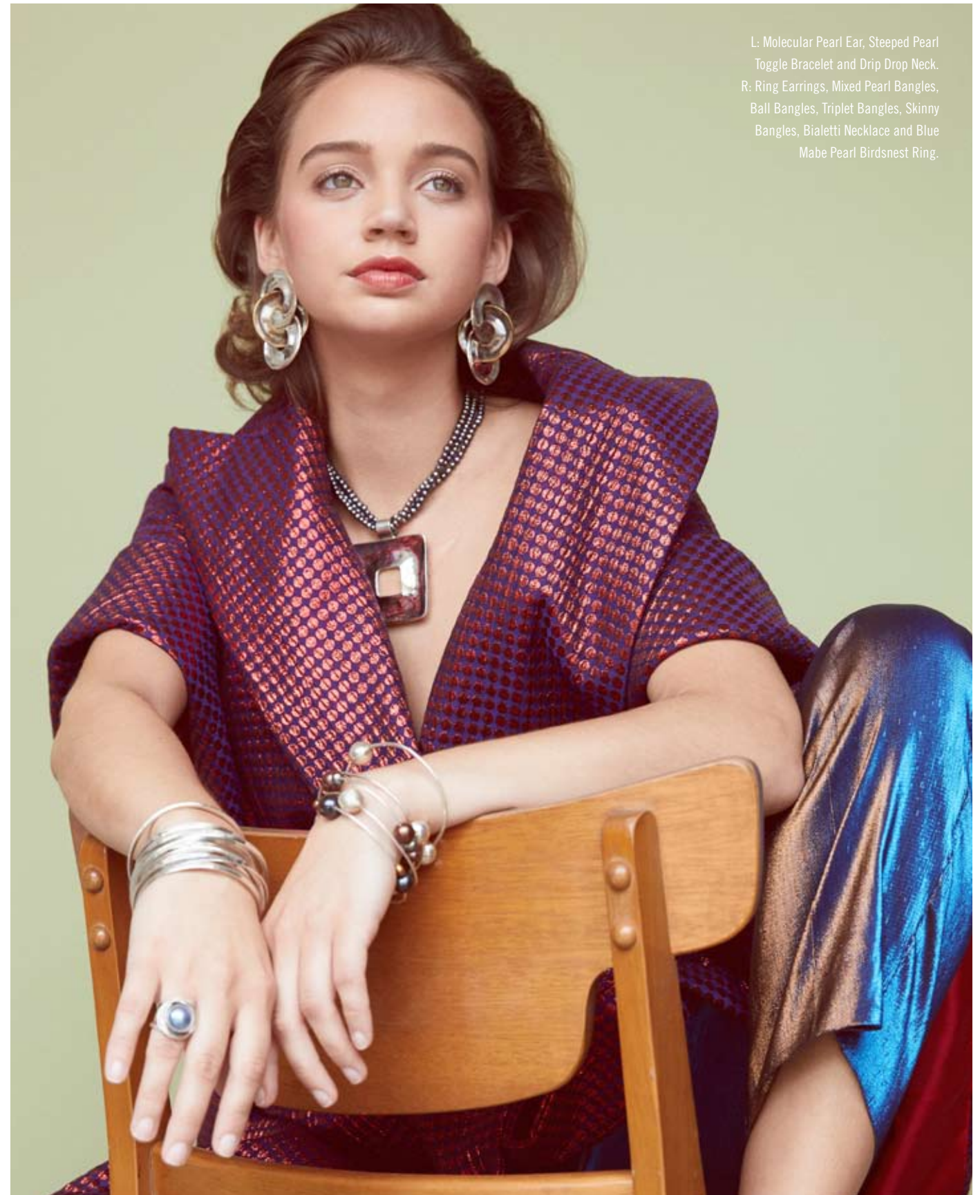
L: Molecular Pearl Ear, Steeped Pearl Toggle Bracelet and Drip Drop Neck. R: Ring Earrings, Mixed Pearl Bangles, Ball Bangles, Triplet Bangles, Skinny Bangles, Bialetti Necklace and Blue Mabe Pearl Birdsnest Ring.