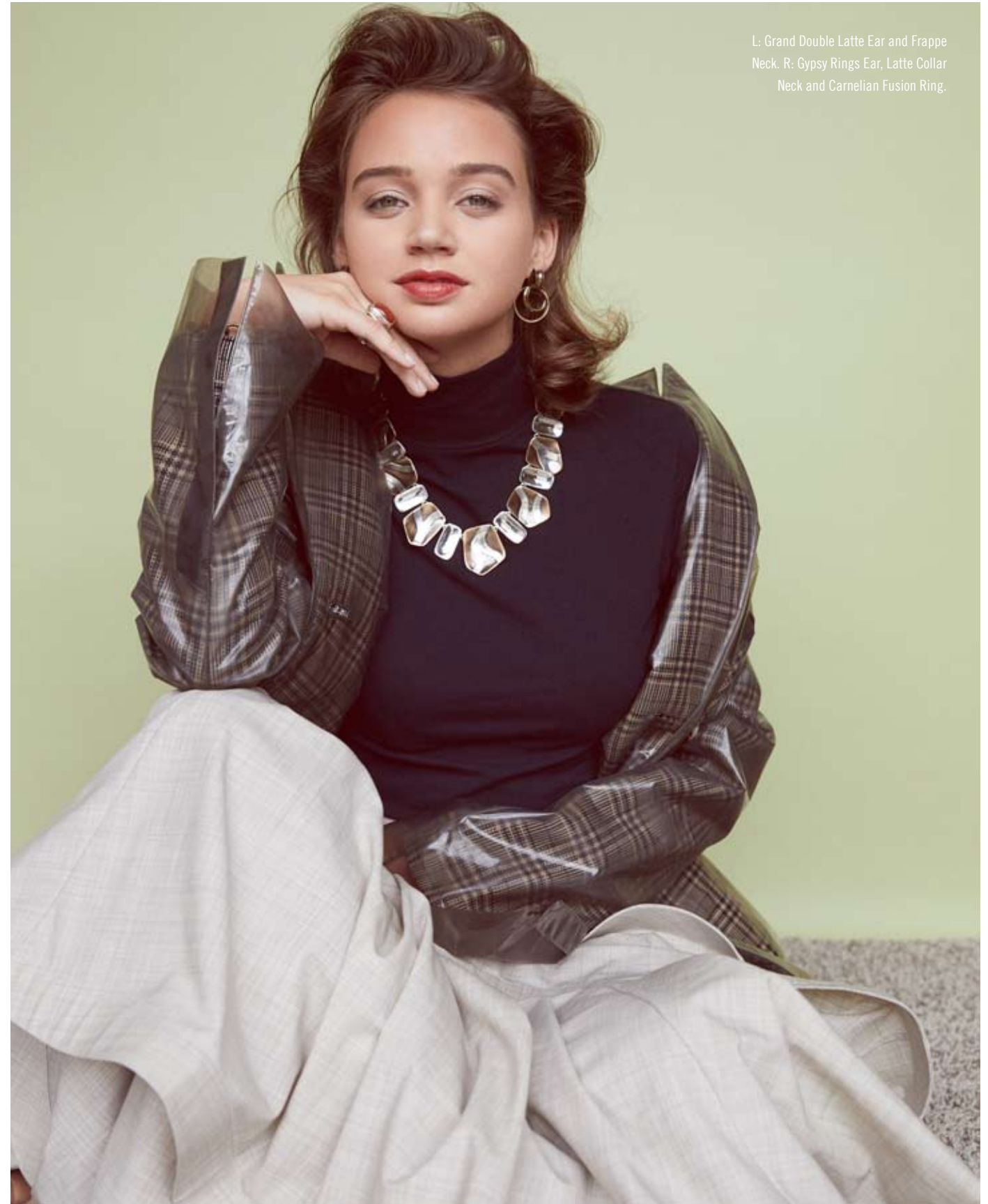
L: Grand Double Latte Ear and Frappe Neck. R: Gypsy Rings Ear, Latte Collar Neck and Carnelian Fusion Ring.