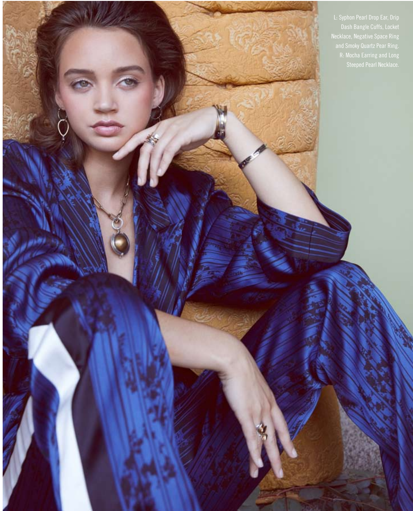
L: Syphon Pearl Drop Ear, Drip Dash Bangle Cuffs, Locket Necklace, Negative Space Ring and Smoky Quartz Pear Ring. R: Mocha Earring and Long Steeped Pearl Necklace.