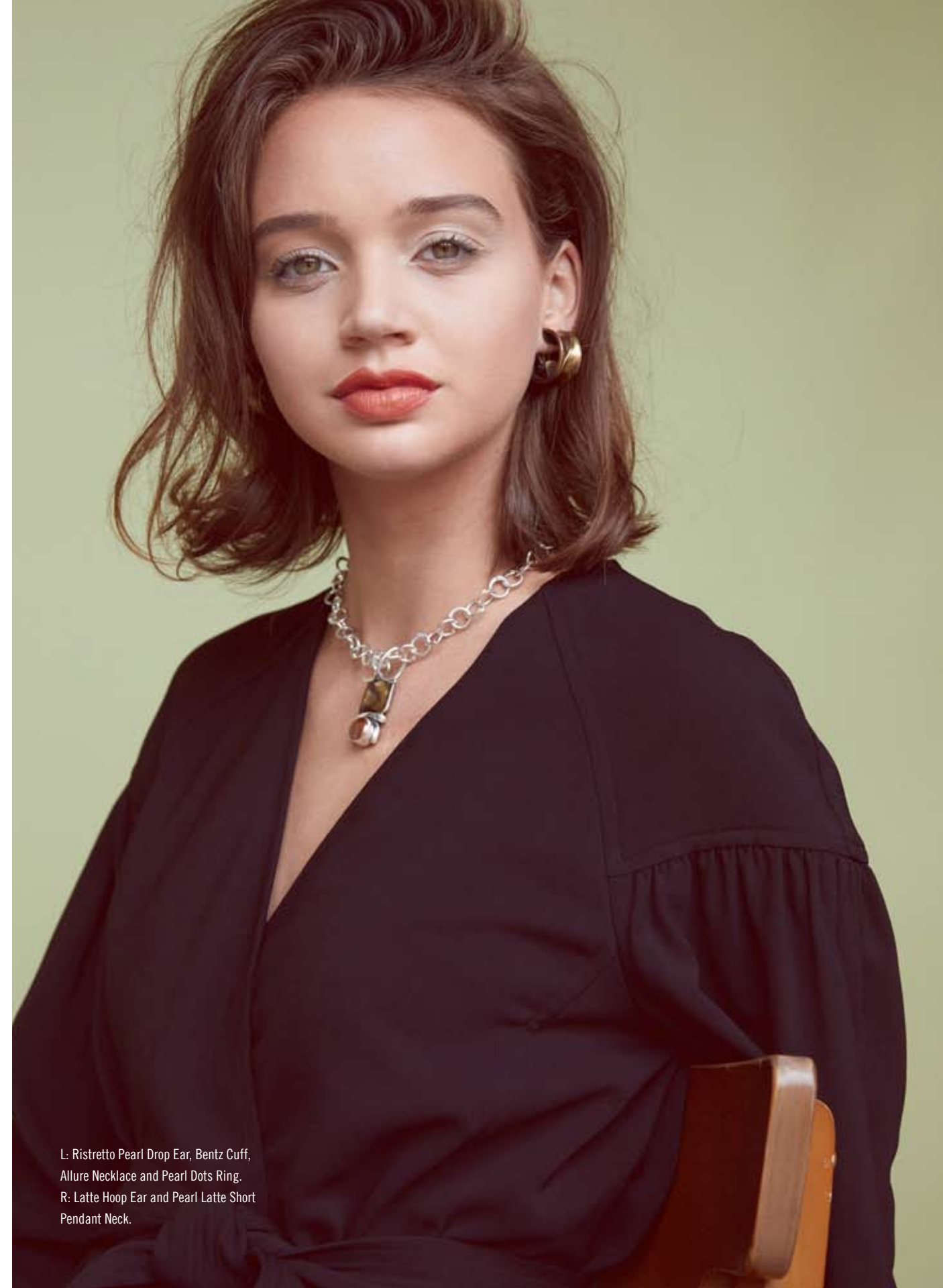
L: Ristretto Pearl Drop Ear, Bentz Cuff, Allure Necklace and Pearl Dots Ring. R: Latte Hoop Ear and Pearl Latte Short Pendant Neck.