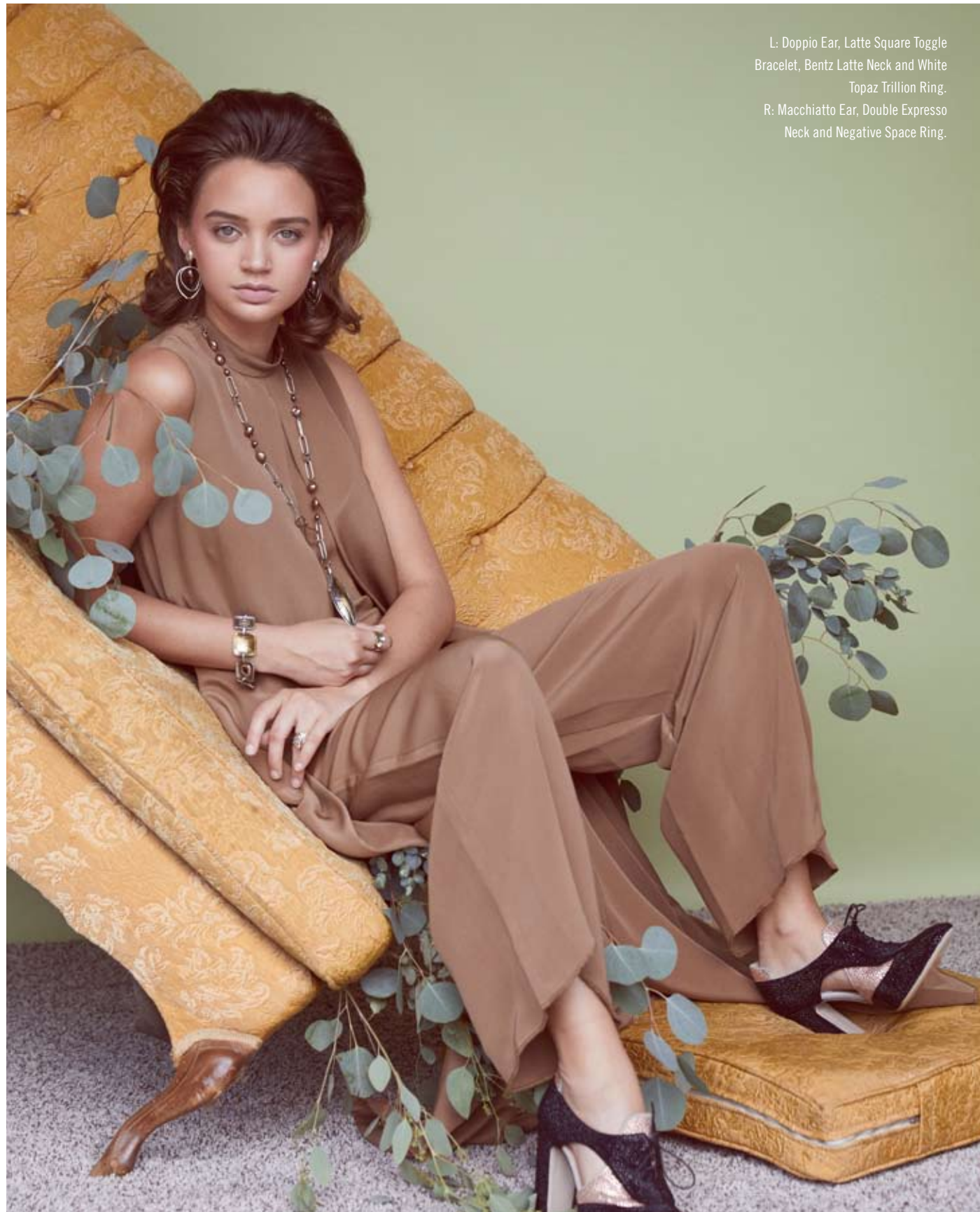
L: Doppio Ear, Latte Square Toggle Bracelet, Bentz Latte Neck and White Topaz Trillion Ring. R: Macchiatto Ear, Double Espresso Neck and Negative Space Ring.